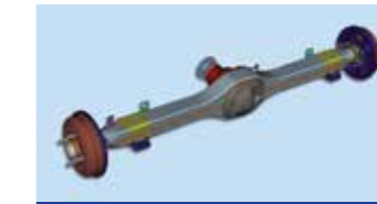
Aggregates - Axle, Gearbox and Clutch