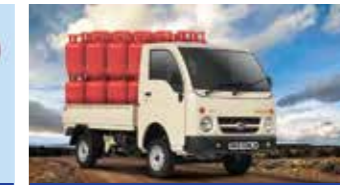
Built for Any Load / Any Road