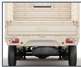
New locking mechanism for enhanced safety