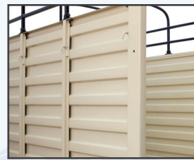
Made of high-quality corrugated steel